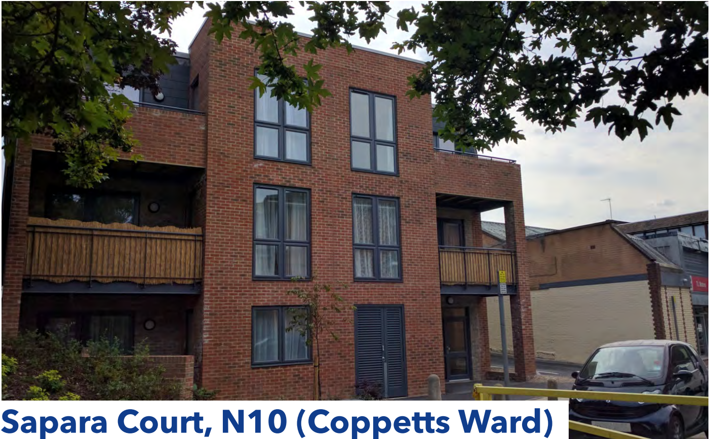
Sapara Court, N10 (Coppetts Ward)